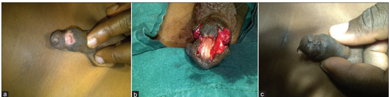
Figure 3: (a) A large urethrocutaneous fistula and peri-fistula scarring. (b) Peri-fistula based Mathieu's flap after excision of the skin bridge, (c) Same patient 3 months after the repair with a good cosmetic and functional outcome and good urine flow