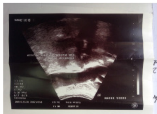
Figure 2: Aneurysm origin