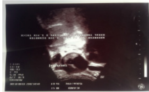
Figure 4: Mural thrombus eccentric to the left