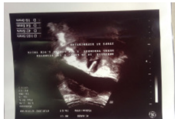
Figure 1: Aneurysm dimensions

removed which was later confirmed histologically to be an organising haematoma. Both common iliac arteries showed no aneurysmal changes and were flushed with normal saline. A 26mm straight woven Dacron graft was then inserted and sutured infra-renally. Aneurysm sac was then sutured over the graft with no leaks. After 1 day of intensive care unit stay, she was moved to the general ward. Repeated imaging of the aorta was unremarkable. She was discharged on the seventh postoperative day and follow up at three months was unremarkable.