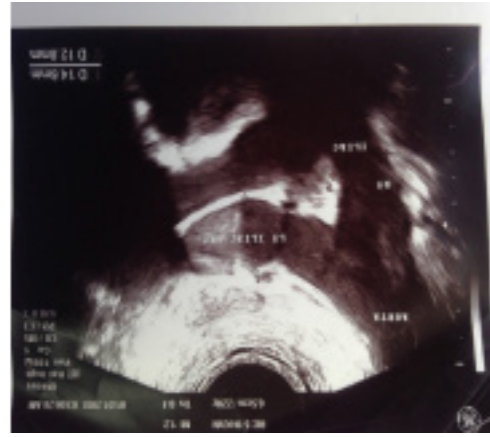
Figure 3: Common Iliac arteries spared