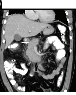
Figure 1: Contrast-enhanced axial computed tomography (CT) [Fig. 1(a)] and coronal CT [Fig. 1(b)] showing normal head (white solid arrow) and uncinate process (black solid arrow) with absence of distal neck, body and tail of the pancreas. Jejunal loops of small intestine (hollow black arrow) and stomach in the distal pancreatic bed can be seen (dependent stomach/dependent intestine sign).