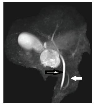
Figure 3: Maximum intensity projection (MIP) image showing a normal common bile duct (black bordered arrow) and duct of Wirsung (white solid arrow). The duct of Santorini is not visualized.