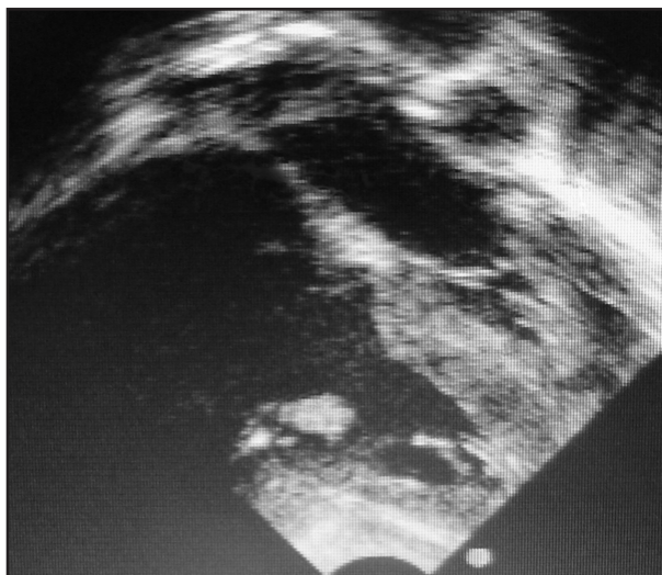
Figure 3: Subcostal 4 chamber echocardiogram showing tricuspid valve vegetations (labelled 'V') in right ventricle during diastole. RA - right atrium, RV - right ventricle, LA - left atrium

Her blood cultures subsequently grew Staphylococcus aureus sensitive to cloxacillin, gentamicin and erythromycin. Unfortunately, the blood culture was not repeated. Therefore, according to the modified Duke criteria (clinical criteria) for the diagnosis of infective endocarditis (1), she was classified as a possible infective endocarditis - with one major (endocardial involvement) and one minor (fever > 38°C) criteria.