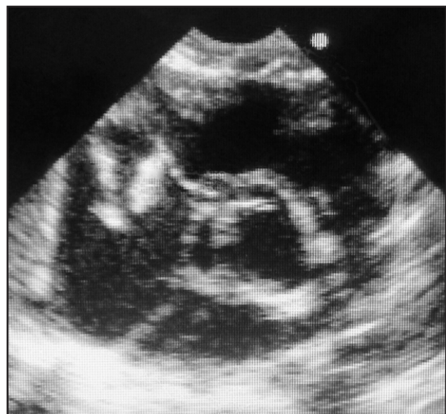
Figure 2: Parasternal short axis echocardiogram showing tricuspid valve vegetations (labelled 'V') in right atrium during systole. RA - right atrium, RV - right ventricle, A - aorta.

In view of her chest x-ray, an echocardiogram was done which showed a large oscillating intracardiac mass (vegetation) on the tricuspid valve and tricuspid valve regurgitation. There was no other cardiac abnormality, in particular no ventricular septal defect or left to right shunt producing a jet impacting on the tricuspid valve (Figures 2 and 3).