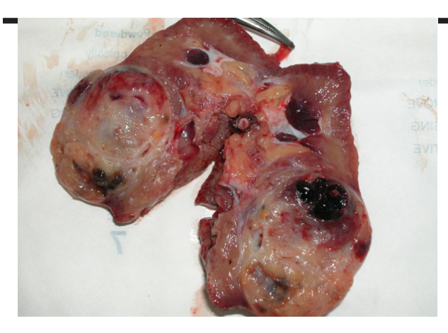
Figure 2. Operative specimen showing well demarcated tumour in the lower pole of the kidney