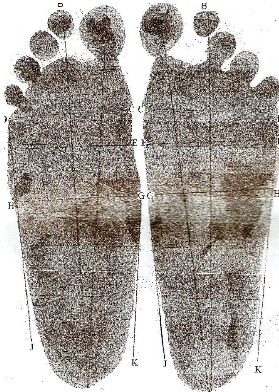
Fig 2: Foot prints of bilateral flat feet