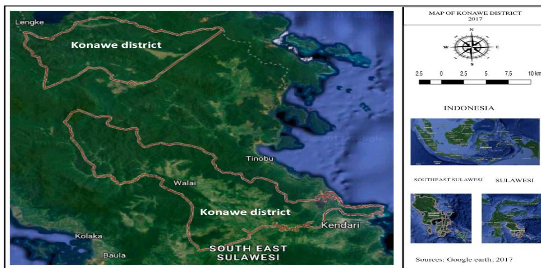
Figure 1: Map of Konawe District, Southeast Sulawesi Province, Indonesia

Konawe is one of the districts in Indonesia with high numbers of DHF cases (13). Many efforts have been made by the government to reduce the number of dengue hemorrhagic fever cases, but the incidence in Konawe District is still high and growing every year especially in 2014-2016 (14). The government has been intensively promoting the eradication of mosquito breeding by closing the container that can hold water so that female mosquitoes cannot lay eggs (15), clean the water reservoirs such as bathtubs, aquariums, and flower vases, burying used goods and using repellent (16). This brief study provides an analysis of the pattern of dengue hemorrhagic fever in Konawe District from 2010 to 2016.