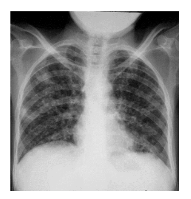
Image 1: Bilateral "other pulmonary infiltrate" in a patient suspected to have LIP