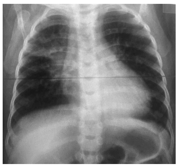
Image 2: Lymphadenopathy with right upper and left lower-zone consolidations