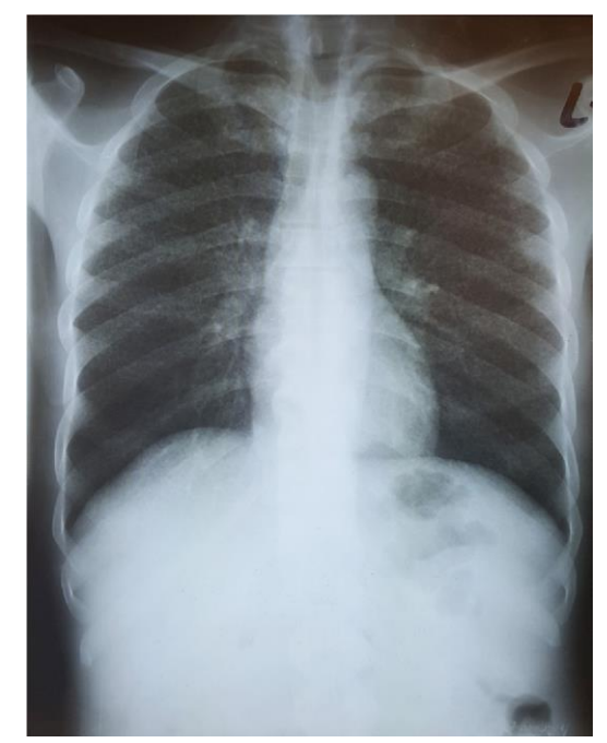
Figure 1: Posterior-anterior chest x rays of the first patient showing uniformly distributed micronodules involving both lungs