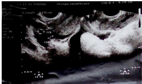
Figure A: Right ovary, follicle at the ovary

hysterosalpingography demonstrated a normal uterus with patent tubes.