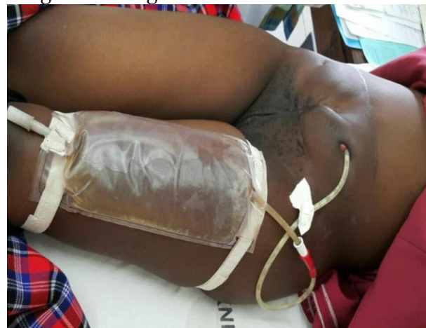
Figure D: supra-pubic catheter

At 32 weeks gestation, she was admitted with pyelonephritis and was treated with intravenous antibiotics with good response. At 33 weeks she had preterm rupture of membranes which was managed as per protocol of Kenyatta National Hospital. An emergency c-section was done after having giving dexamethasone, and a live female infant was delivered with birth weight of 1.4kg, with an Apgar score of 6 1 /8 5 /9 10 and no congenital anomalies were noted. The baby was admitted to newborn unit due to low birth weight and respiratory distress, where she did well and was discharged with a weight of 1.80kg.