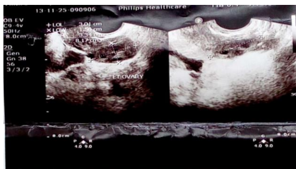
Figure B: left ovary