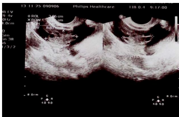
Figure C: right and left ovaries (though bladder was not visualized, other abdomino-pelvic organs were normal)

During her first visit to the ANC the patient was at 20 weeks gestation, an obstetric Ultrasound done six days prior to this visit revealed a single viable intrauterine