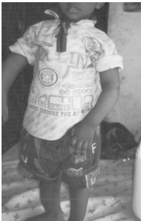
Figure 2 Arms and legs of young boy with rickets