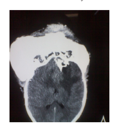
Figure 1 Post-contrast axial reformat

An apparently June 2012.indd 214 7/30/13 12:54:11 PM