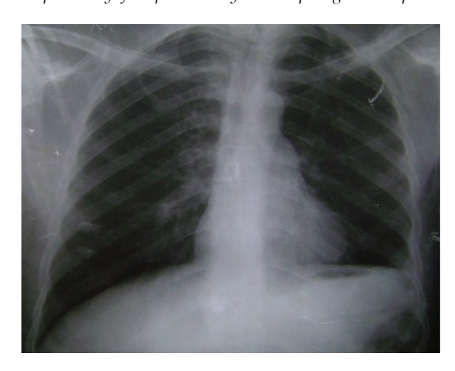
Figure 2 The postoperative chest radiograph three weeks after the laparotomy for splenectomy and diaphragmatic repair

There was no mortality. Most of the patients recovered quickly and well (Figure 2). Two patients developed a complication, the 18 year old male after a gun shot wound to the chest had multiple rib and scapula communitive fractures. He was shot by the police while he was involved in an act of robbery, and was operated on the 14th days after the trauma. The next day after surgery, the police handcuffed him strongly to the bed for two weeks. Being unable to do chest physical therapy he developed a wound, scapula and ribs infection. When we succeeded to have him released by the police he eventually recovered and was discharged home on antibiotics.