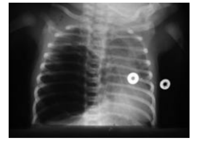
CXR done at the time of admission, demonstrating right hemi thorax luscency with shift of the mediastinum to the left as well as inversion of the diaphragm