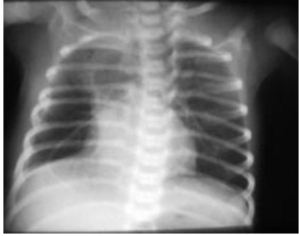
Chest radiograph taken on sixth post operative day following removal of chest drains showing right upper lobe atelectasis and bilateral basal air trapping. The rest of the lungs are clear.

Recovery was uneventful and the patient was discharged home on the fifth post operative day. Our patient was well and demonstrated normal growth and development on follow up to one year after the operation.