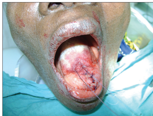
Figure 2: This is postsurgical view of tongue showing closure and new shape