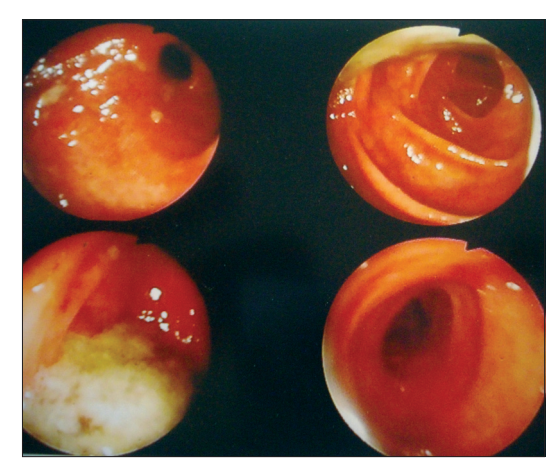
Figure 1: Colonoscopic view of the lower and upper rectum, sigmoid and descending colon of Case I

There was no remarkable finding on clinical examination except bloodstained loose feces. Stool examination did not isolate any pathogen and HIV screening tests were negative. He had irondeficiency anemia, mild leukocytosis, mild hypokalemia and