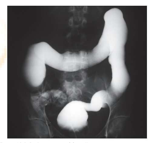
Figure 2(a): Barium enema of Case II