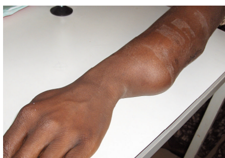
Figure 1. Forearm swelling Histiocytosis X