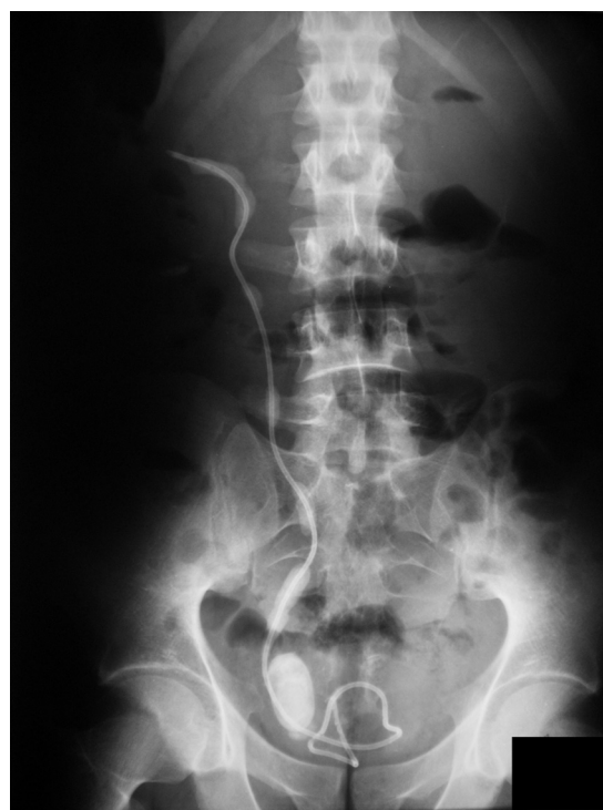
Figure 2 Plain-film radiograph showing encrusted ureteral stent with large stone burden in bladder, kidney and ureter.