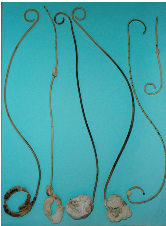
Figure 4 Examples of removed ureteral stents.

in 4 patients (Fig. 4). Examination of the broken stents showed that breaks had occurred at points where the encrustation had made the stent very brittle. All the removed encrusted stents were made of silicone. Sixteen patients (72.7%) were rendered stone-free and 5 (22.7%) had clinically insignificant residual stones (3 mm or less). The mean hospital stay was 3.8 days (range 1–9 days).