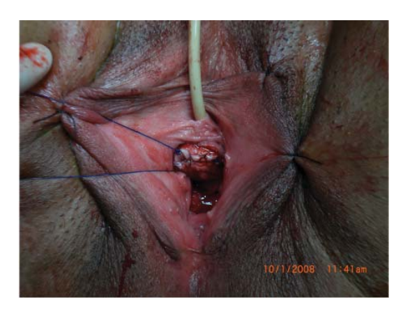
Fig. 3: The flap is then rolled on itself and suspended by two sutures attached to both ends.

dissection, the lateral spaces are dissected. The surface of the vaginal flap is cauterized using diathermy in order to reinforce the flap. Two diagonal rows of 0 polypropylene sutures are taken through the flap to further fortify the vaginal flap and make it less stretchable. Two 1-cm transverse incisions are made one fingerbreadth above the pubis on both sides of the mid line. The flap is then rolled on itself (Fig. 2) and suspended by two threads attached to both its ends, then passed on a ligature carrier to the suprapubic area and tied together over the rectus fascia. More tension is used in patients with VLPP< 60 cm/H<sub>2</sub>O. This is guided by the Q-tip test intra operatively. The vaginal wall is closed with a running, locking 2-0 polyglactin suture. A vaginal packing impregnated with antibiotic ointment is placed.