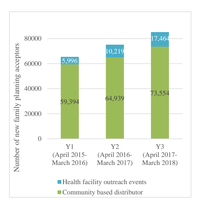
Figure 2: New family planning acceptors by service delivery point