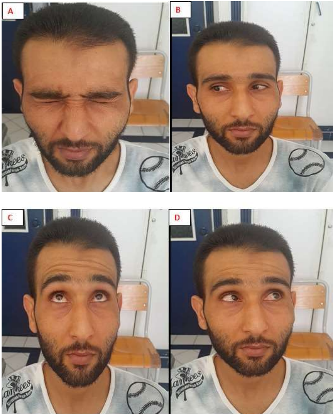
Figure 3: patient 6 weeks later: cranial nerves examination is normal;

A: eyelid orbicularis muscle (VII nerve);