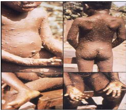
Figure 1: A child affected by monkeypox, showing generalized vesiculo-pustular rashes involving the trunk, limbs, face and limbs, extending to the palms and soles of the feet.

and generally less severe disease (4,16). Conditions which suppress cell-mediated immunity such as HIV may alter the natural history of the disease and may result in more severe infections (15). The lesions seen in them are also noticed to have regional monomorphism and a centrifugal distribution. Lesions in children may appear as nonspecific 1-5 mm erythematous papules, resembling an arthropod bite reaction. Mortality rates range from 1 to 10% with most cases occurring in children and in unvaccinated persons (16). Indirect or low-level exposure may result in asymptomatic or subclinical infections especially in persons living in or beside forests. Complications of monkeypox infection include pitted scars, deforming scars, secondary bacterial infection, keratitis, corneal ulceration, blindness, bronchopneumonia, septicaemia and encephalitis (3,5,17).