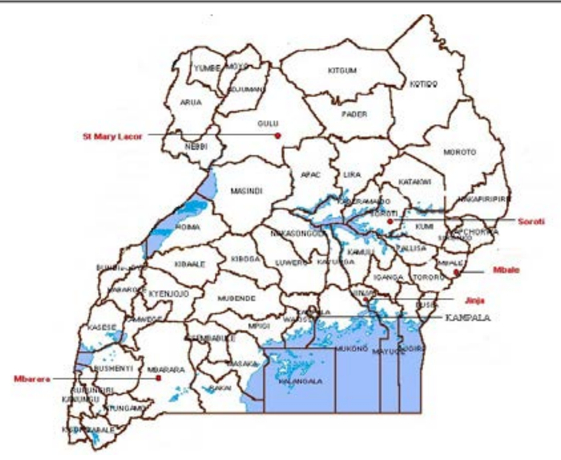
Figure 1: Map showing location of hospitals conducting research