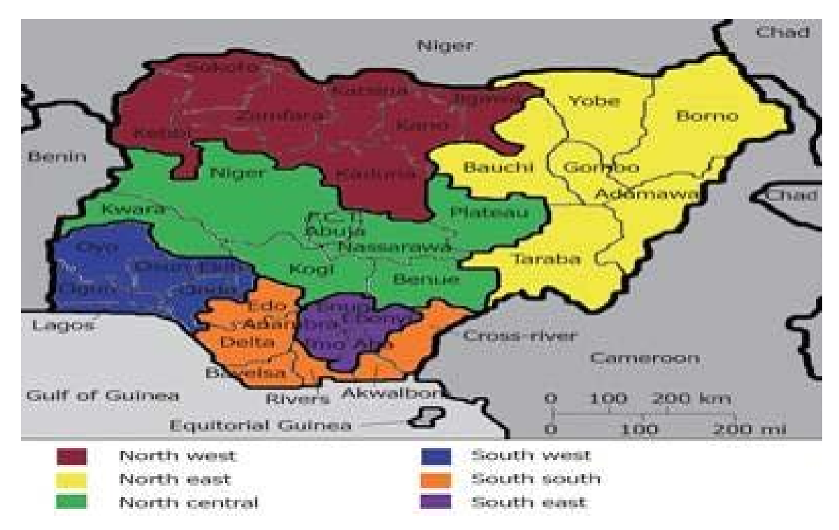
Figure 1: Map of Nigeria showing the six geopolitical zones and states

sured by the number of antenatal visits (<4 or ≥4 visits) and place of delivery (home or health facility). A two stage cluster proportionate to size sampling technique was used to recruit 33,385 women from all the 36 states and the federal capital territory which were clustered into 6 geopolitical zones (Figure 1).