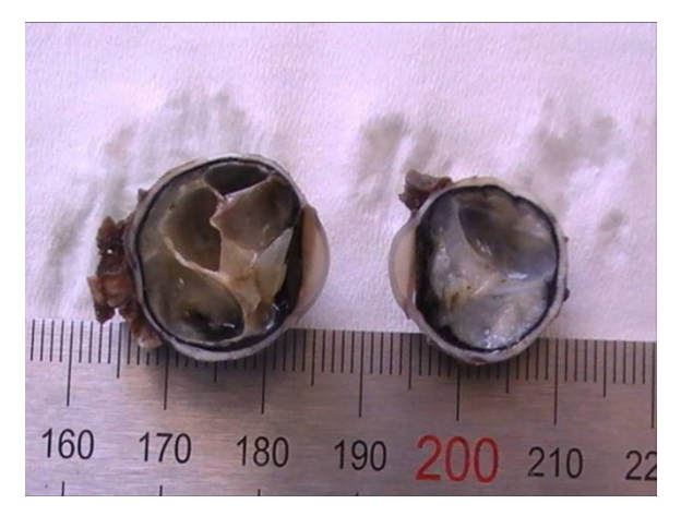
Figure 1. Morphological findings in our reported case of Coats' disease. A: Gross cut section of the eyeball, showing a whitish mass filling the vitreous.

The cornea was misty but the lens was normal. No obvious optic nerve involvement was noted. As the microscopy of the primary slides showed no evidence of retinoblastoma, the whole eyeball was subsequently sectioned and processed, to exclude the possibility of retinoblastoma.