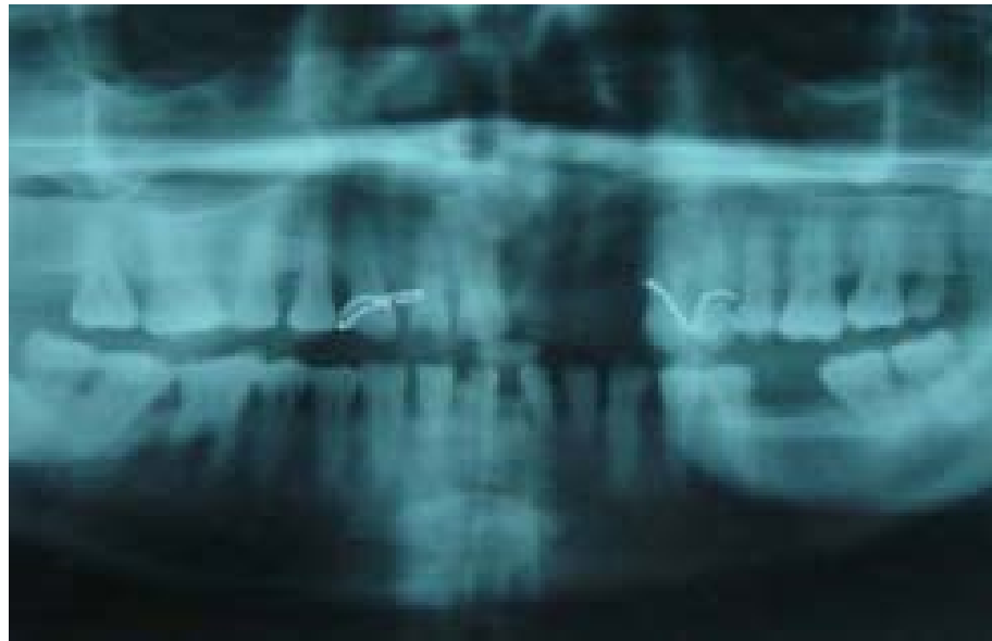
Figure 2B the paternal print- II, 4 showing lateral conical incisors, with marked dysplastic enamel.