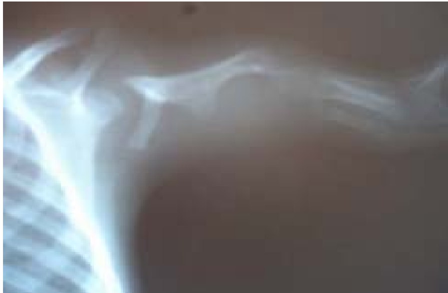
Figure 1 C: Spinal X ray of the proband showing marked juvenile scoliosis secondary to congenital limb deficiency.

Figure 1 B: X-ray of the upper limb of the proband: note the severe abbreviation of the humerus, which is attached to an ectopic bone, clavicular duplication, markedly dysplastic supernumerary radial bones with rudimentary ulna and severe dysplasia of the fingers.