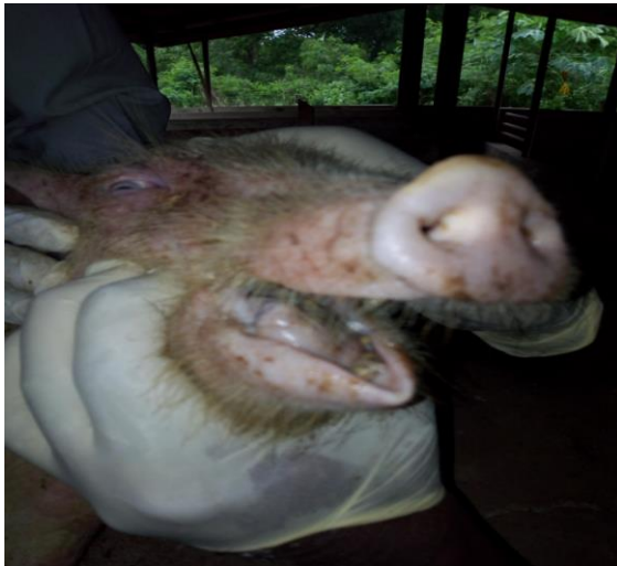
Plate 3: Showing curling of the tongue. thorax