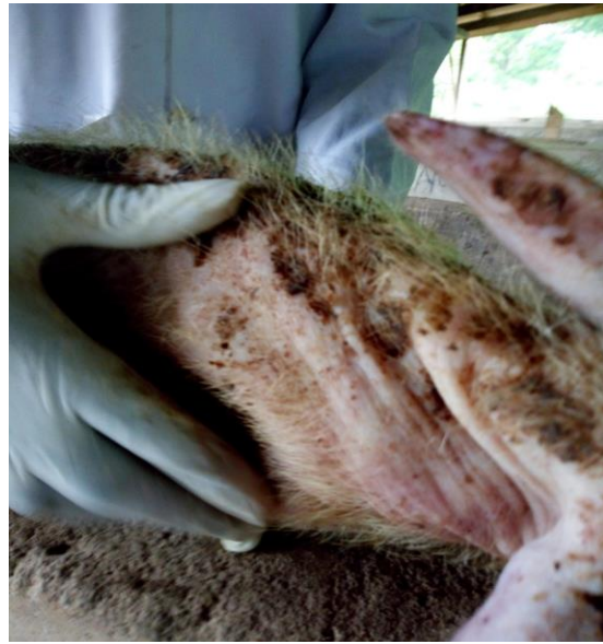
Plate 2: Showing wrinkling of the skin