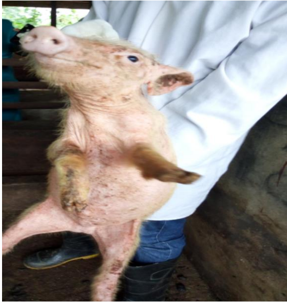
Plate 1: Showing area of alopecia at the ear and abdomen.