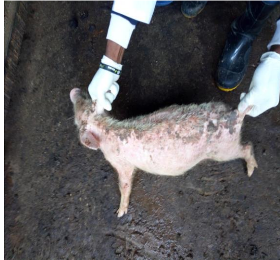
Plate 4: Showing area of thickening around the

A tentative diagnosis of mange was made with the following differentials: Allergic dermatitis, Bacterial dermatitis, Fly bite dermatitis, Hypovitaminosis. To further confirm the diagnosis, a deep scraping of the skin was done (until capillary blood was oozing out). The scrapings were collected