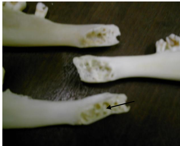
Fig.2: Arrow showing conspicuous interdigitating ruggae in the mandibular symphysis in the Red Sokoto Goat. From top down are the WAD, Sahel and Red Sokoto