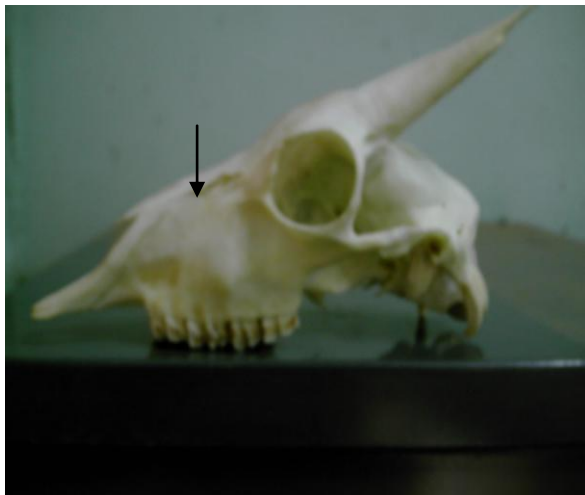
Fig. 1: Arrow showing interacting area between the nasal, incisive and maxilla bones

WDA: Animals without dental abnormalities