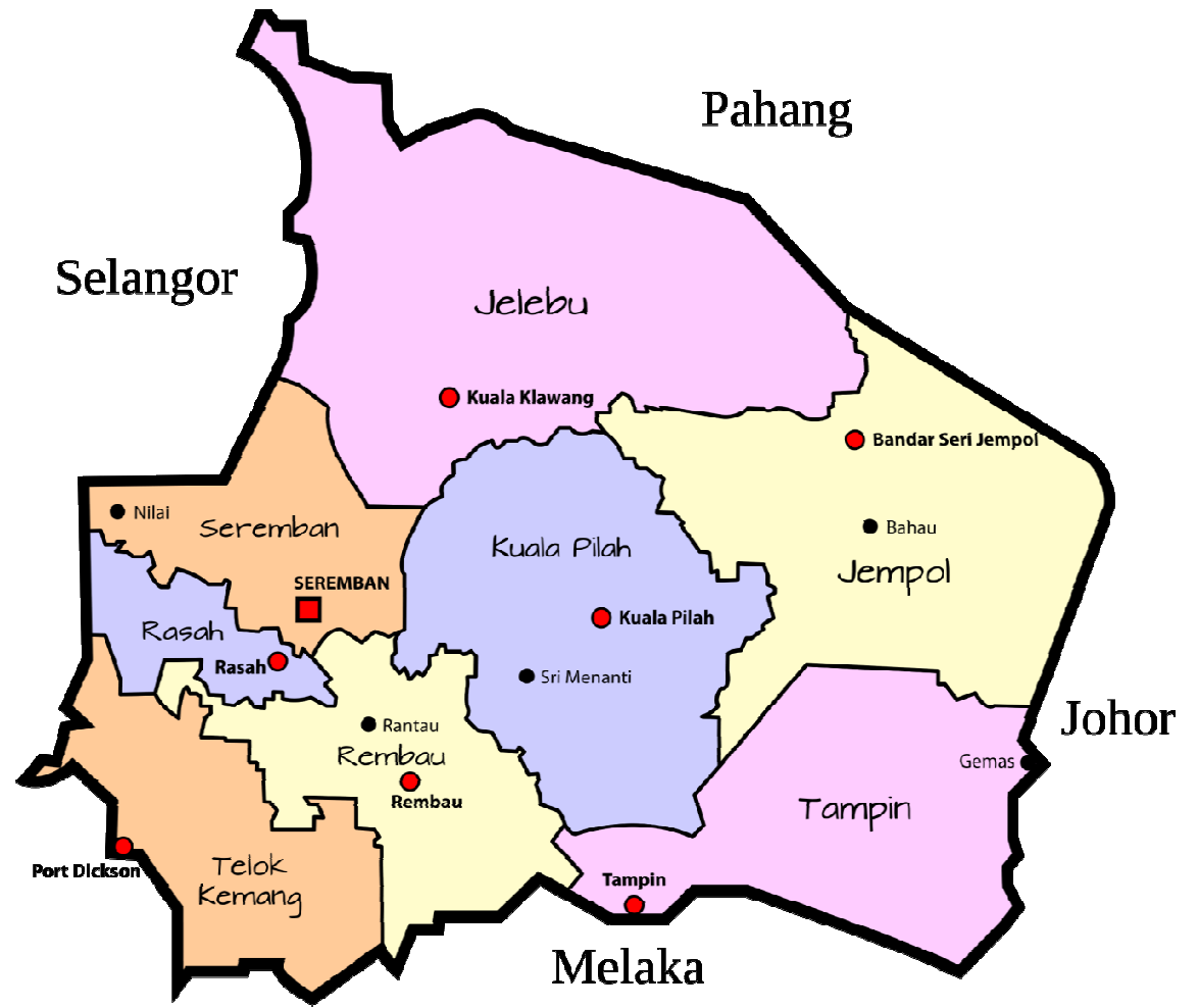
Figure 1: Map of Negeri Sembilan showing Various Districts and towns.

Figure 1 is a comprehensive map of Negeri Sembilan State where the research work was carried out.