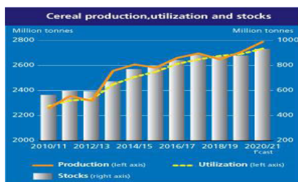
Figure 2: World cereal production, utilisation and stocks