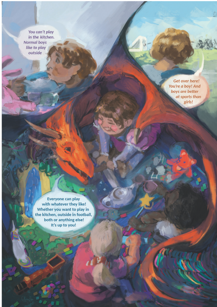
Figure 1: Olivia Rea, The Dragon of Protection , 2019. Digital illustration. Australia. Use of images permitted by team. Copyright © 2019 S. Goodliffe, I. Plug, A. Cosma, T. Magnée, S. Hiltner, P. Joy. All rights reserved.

Weisgram 2018: 257), research about gender typing is often framed with the binary understandings of gender. Thus, gender typing research is entrenched in discourses that are normative and anything 'other' than the binary is transgressive of gender. Gender typing also intersects with other social factors that impact health over an individual's life course, which needs to be examined when designing effective gender transformative health policies and programmes (Gupta et al. 2019; Heymann et al. 2019).