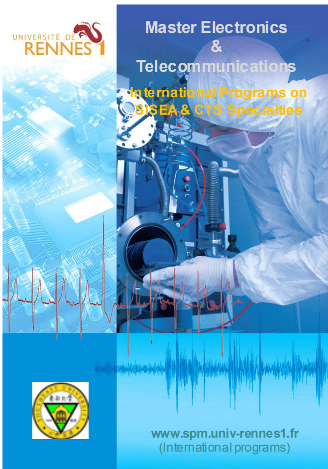
Figure 2. Figure 1. Figure 2. Booklet of presentation of the international program of the master built by SEU and URI

The authors are very indebted to President H. Yi of the SouthEast University and to President G. Cathelineau and to