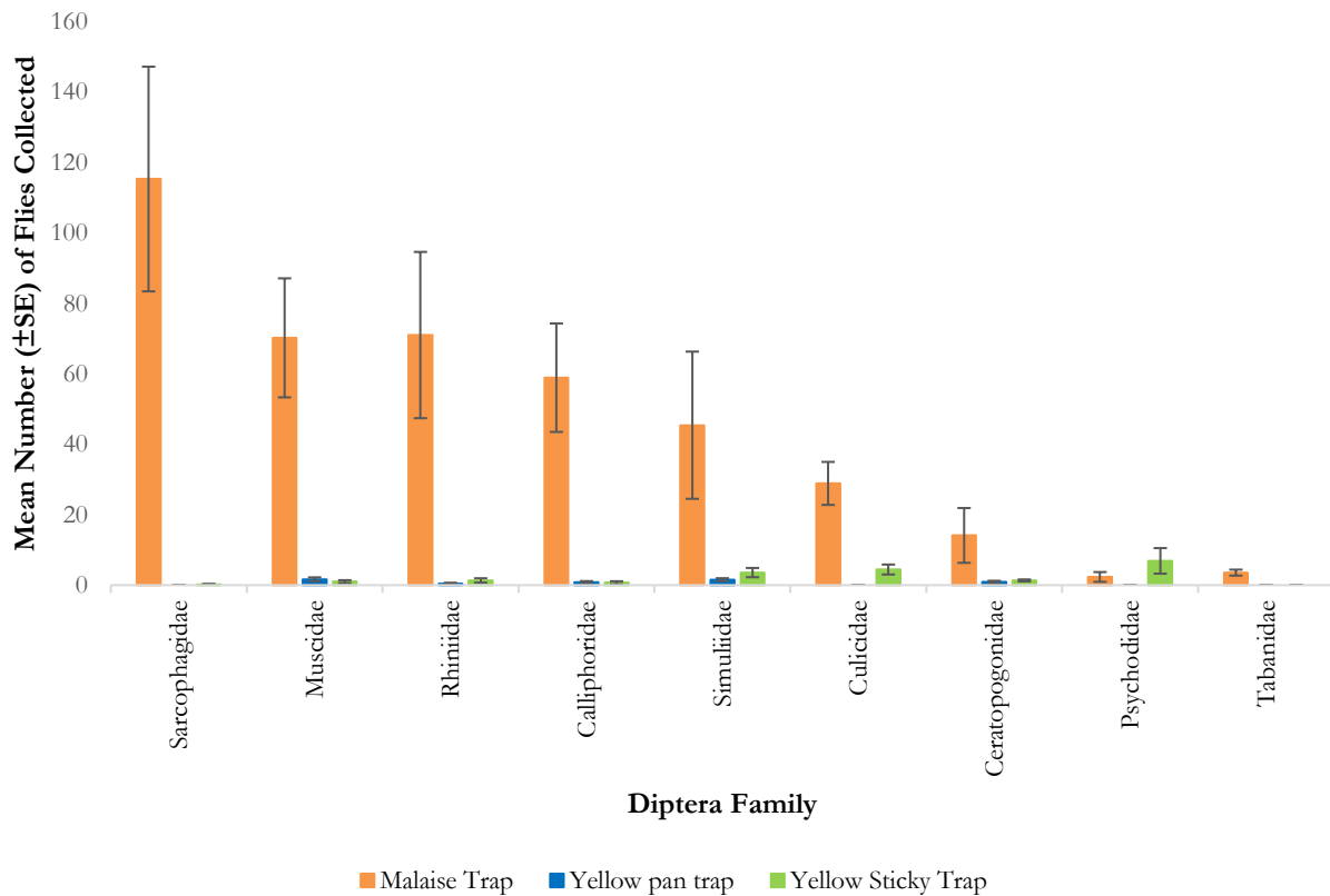
Fig. 3. Mean number ( \pm standard error) of flies sampled from three different traps and the Diptera families.

One of the factors that may influence the higher number of Diptera family collected in Malaise trap is the location of the traps that were set up. All the three Malaise traps used in this study were installed in between vegetation and small ruminants' sheds. Vegetation of an area provides an ecosystem to insects, where it serves as their source of food, feeding, reproduction, growth and resting sites (Triplehorn and Johnson, 2005). In addition to, insect diversity and abundance are often positively correlated with plant diversity (Wenniger and Inouye, 2008). Since the Malaise traps were installed in between the vegetation areas and the animal sheds, the flight activity of more insects between these two locations was intercepted by the trap. Thus, a more diverse group of Diptera was collected by Malaise trap compared to the other two traps.