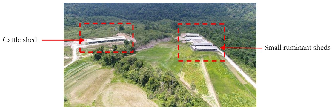
Fig. 1. The location of the small ruminant sheds in Ladang UniSZA Pasir Akar.

The study was conducted at Ladang UniSZA Pasir Akar, Besut, Terengganu, Malaysia (5.788° N, 102.587° E) in small ruminants rearing area. This farm rears four breeds of goats: Saanen, Boer cross, Jamnapari cross and Boer cross Jamnapari, and three breeds of sheep: Dorper, Santa Lues and Balckbelly. The small ruminants were kept in four different sheds (Shed A, Shed B, Shed C and Shed D), with only Shed B with a mixture of goats and sheep. The farm also has one cattle shed located about 500 meter from the small ruminants rearing area. This farm is mainly surrounded by forest.