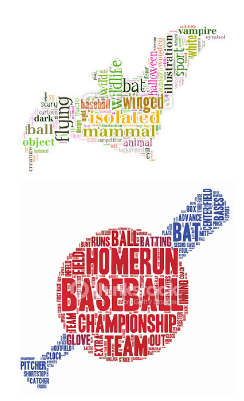
Figure 2. Illustrative contextual word clusters associated with the word "bat"

seemingly separated quantum systems behave as one, and contextual meaning can be correctly understood. [29][31]