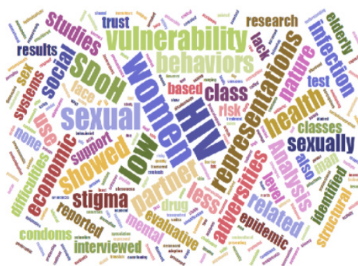
Figure 2 - Word cloud Results. Recife, PE, Brazil, 2020.

Continuing the order of words in Figure 2, which is the analysis of the results, we can see the words HIV, vulnerability and condom in prominence compared to the other words, but that these are linked to the words prevention, woman, partner, among others. This familiarity in the word cloud and its importance within the analyzed material is striking, as these terms are the answers to the objective and, consequently, are associated with the topic in question Figure 2.