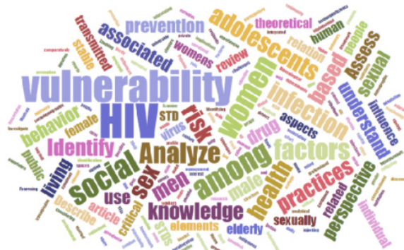
Tabela 2 – Ranking of terms extracted from the Corpus methodology present in the first three spheres. Recife, Brazil. 2020.