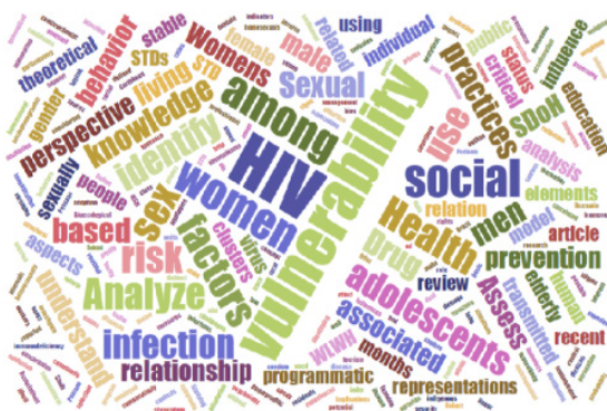
Figure 4 - General Corpus word cloud. Recife, PE, Brazil, 2020.

In Figure 4 , it can be seen that in the first sphere, the words HIV, vulnerability and woman are highlighted, which have frequency of 86, 59 and 45, respectively. Next, the words use, health, sexual appear with 41, 39 and 37 times, respectively. It is noticeable how important these terms are within their scope, since these words are correlated with the title and abstract Figure 4 .