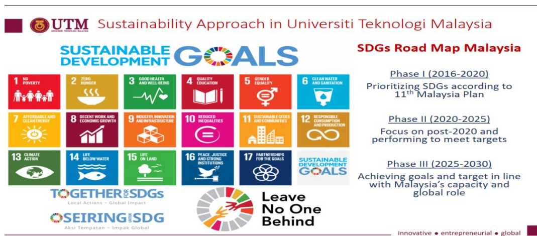
Figure 1: UTM SDGs governance roadmap towards the national blueprint

integrating the SDGs at UTM campus not only focused on justifying the development of environmental partnerships but also incorporating the framework in the University Global Plan (I-III) and involving all stakeholders within the campus (Figure 1). UTM is assessing and debating the needs of the Key Focus Area (KFA) which incorporates university strategic plans that build on short-term needs in terms of organizational structure and empowerment. Each year, the university will re-examine the initiatives undertaken, especially involving quantitative value, impact, and significance based on the current developments. These include policy, education, research, operation, community and financial structure, which include several procedures measured through the Key Amal Indicators (KAIs) index. Unlike the 2015 experiences, the inclusive approach to SDGs in the university strategic planning will reinforce the medium and long-term needs, especially involving governance, finance and operation. Preliminary actions taken by UTM add value to the strategic plan by using the SDGs framework throughout the selection of indicators, elements, values and impacts, and the constructive analysis by different sectors. Therefore, Malaysian higher education institutions should take proactive steps in culturing SDG initiatives – guided but not bounded by the specific measures set-out in the UN Conference.