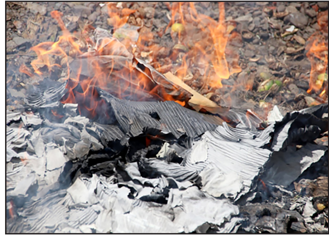
Figure 3: Ruthy's photo at Awagasi market: She dreams of buying her own block of land.

set date, and all issues are addressed in the presence of local police. The presence of Omili police station just meters away from the market, in addition to strong community leadership, ensures that criminal elements, offenders, fraudsters and other deviant characters are brought before the police and law and order committee. One woman leader