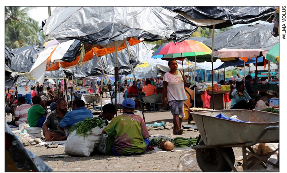
Figure 1: Awagasi Market in Lae City

Across the three categories of events, commentaries and initiatives, a key finding was that the most vocal personalities were from government and the police (see Figure 1). Significantly, community members' voices were minimally heard. In many cases, community members and leaders echoed their voices only behind government agents. Police were the most frequently quoted sources for accounts of events occurring within settlements, such as evictions and crimes, as these tended to be documented through media releases issues by the police.