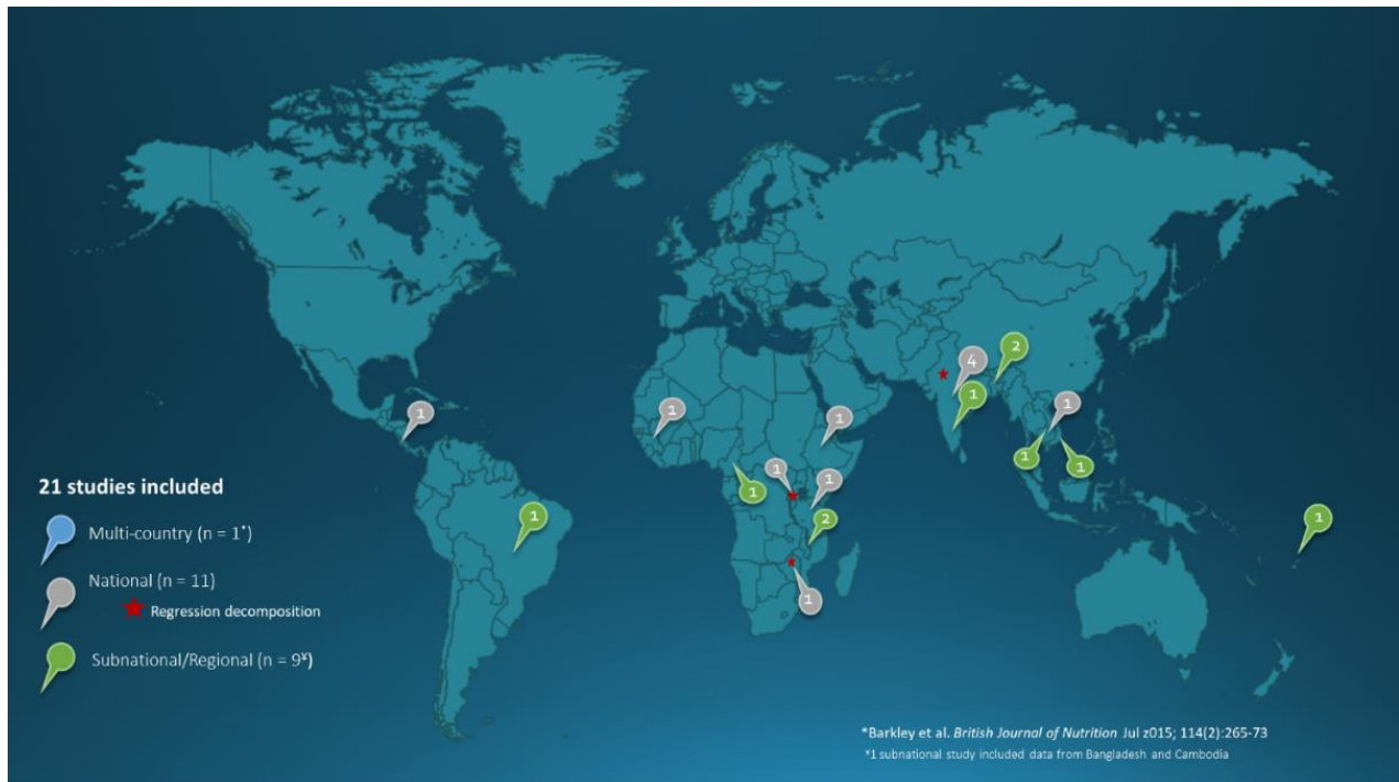
Figure 3. Setting and sample representativeness of included studies.

The 21 studies included in this review [19–39] include data from 38 countries from Asia, Africa and Latin America (Figure 3), and assess trends in anemia among WRA between 1990 and 2017. The characteristics and quality appraisal scores of the included studies, as well as the observed annualized reduction in WRA anemia, are presented in Table S1.