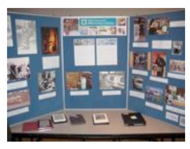
Several Lower Mainland public libraries host an "Everything eBook" session for the public in conjunction with the day's events at VPL.