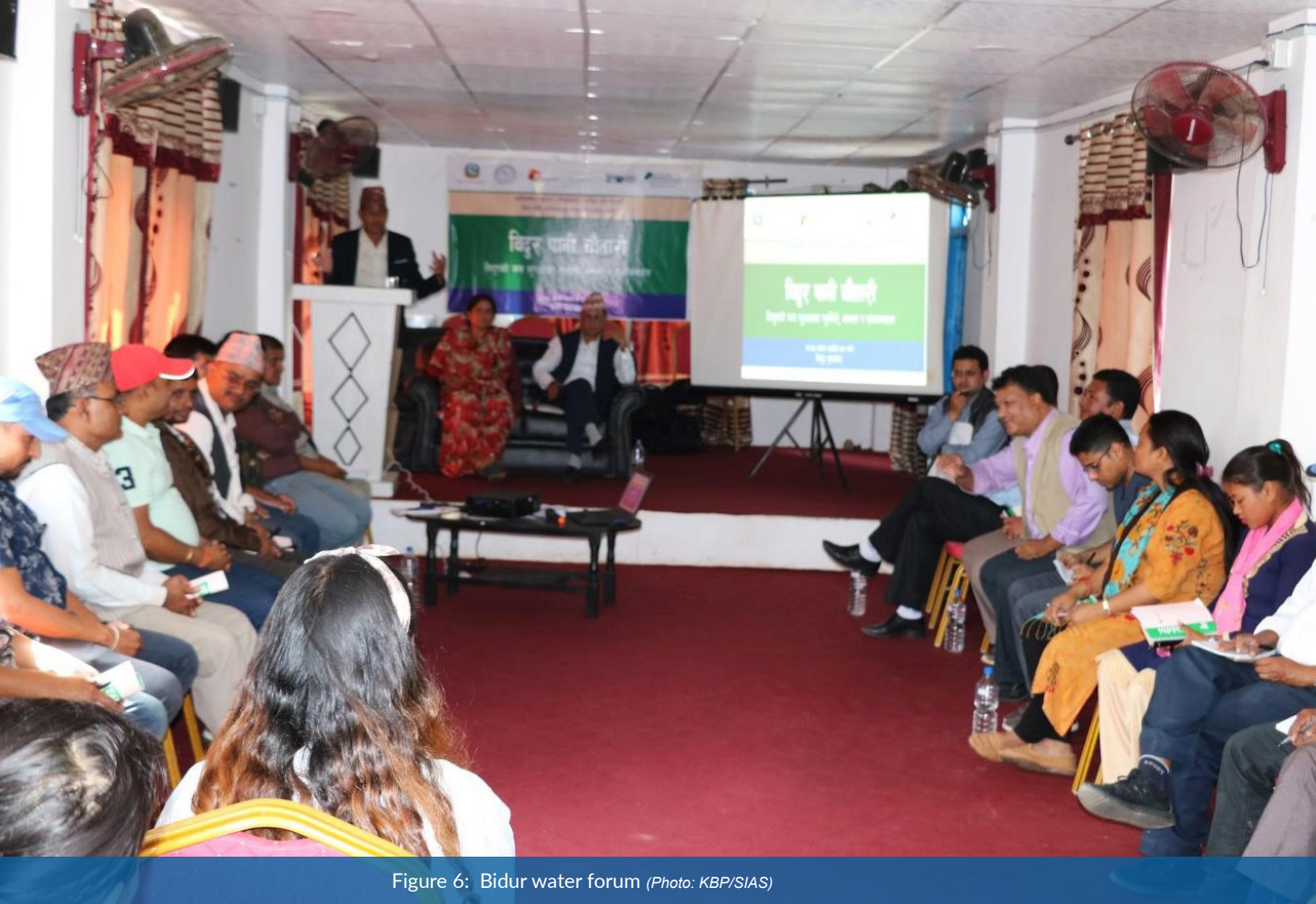
Figure 6: Bidur water forum

Second, creating research-informed planning and discussion forums at the community and municipality level is important. Focused and continuing dialogues among municipal authorities, researchers, and all prominent water actors are vital to explore, inform, and develop measures to ensure sustained and equitable supplies of water. In the Pani Chautari or Water Forum that we supported during our research, our research team stimulated stakeholder discussions with research-based evidence and knowledge. For instance, in the Water Forum organised in September 2019, the municipality came to recognise the need for better recognition of the twin-track strategy of supporting larger and smaller projects simultaneously. Following this Chautari , the municipality is actively supporting existing small-scale schemes and local springs through municipal planning and budget allocations.