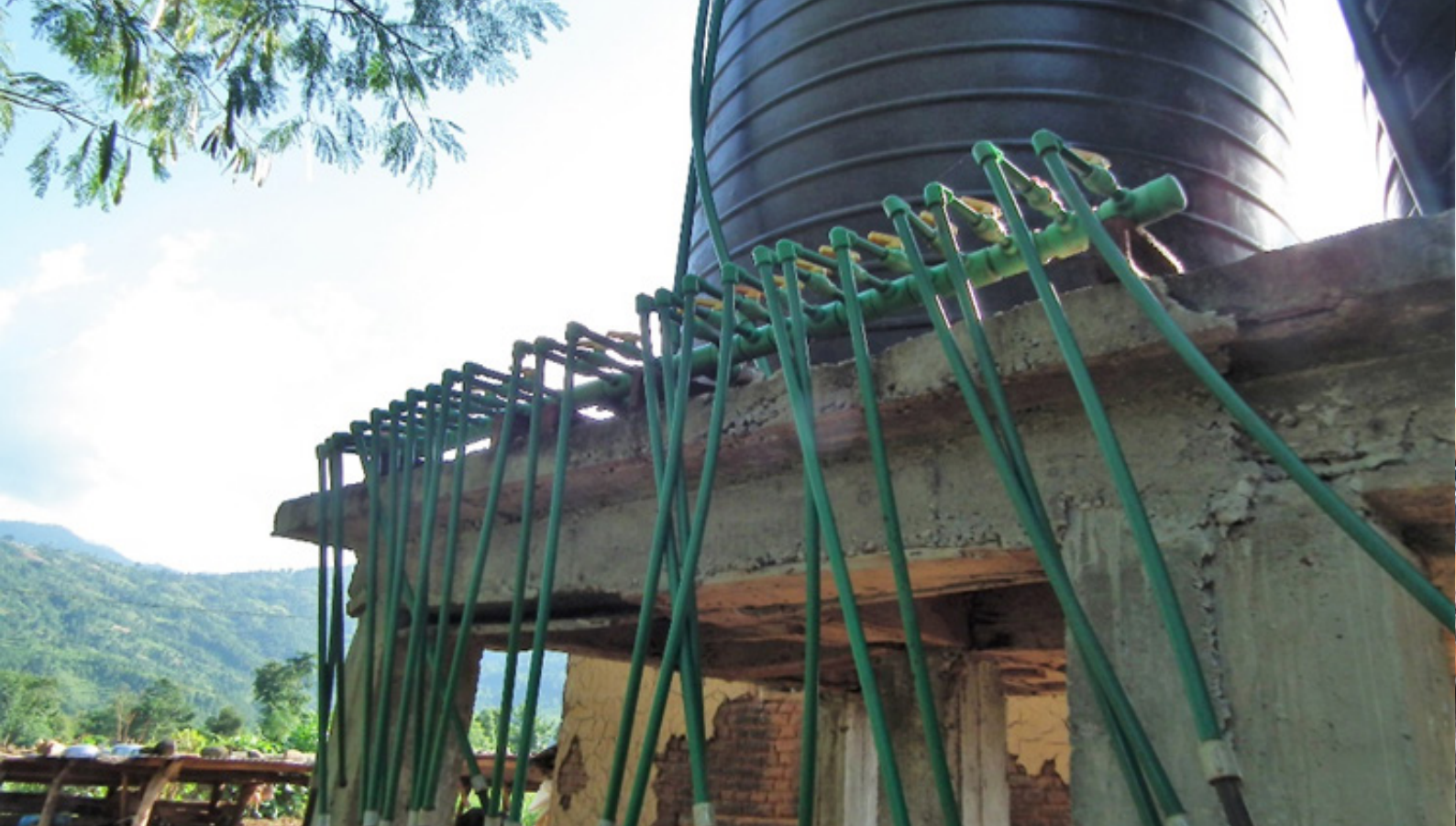
Figure 5: Small-sized community-based water users committee supply private taps to households

system managed by the BDWSUC, the rest turned to several smaller community-led water supply systems in the town, especially in the southern suburban areas. These community-led projects emerged after 1996 in Nepal when the state was paralysed by nation-wide conflict, which left the town without an elected local government.