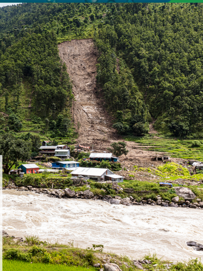
Figure 1: The landslide triggered by an earthquake swept away the water intake pipes