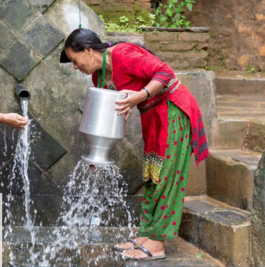
Figure 2: Water source used by women soon after the 2015 earthquake