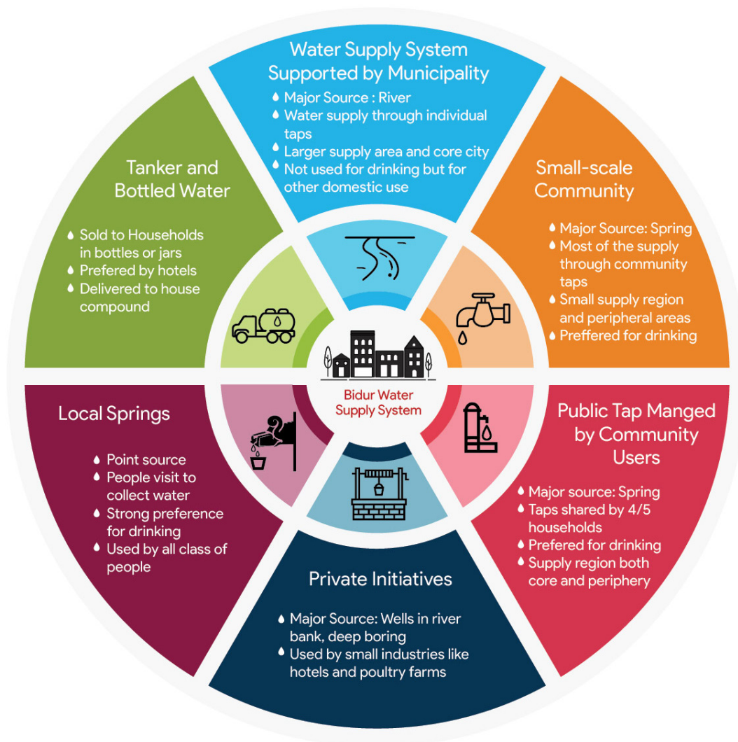
Figure 4: Diverse water management schemes of Bidur