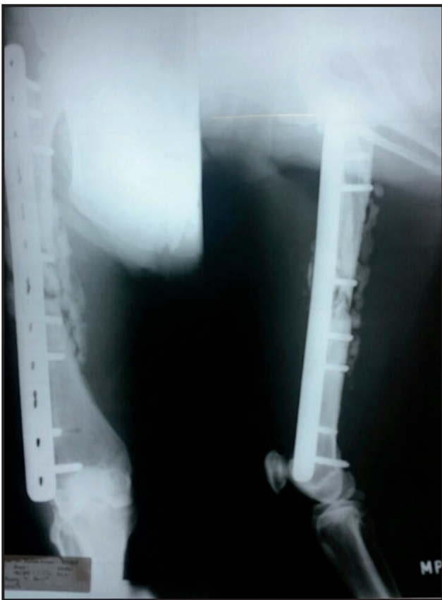
Figure 3. Right femur radiographic image 127 days after surgery shows periosteal bone proliferation in the middle third of the right femur. Giant anteater (Case 1).