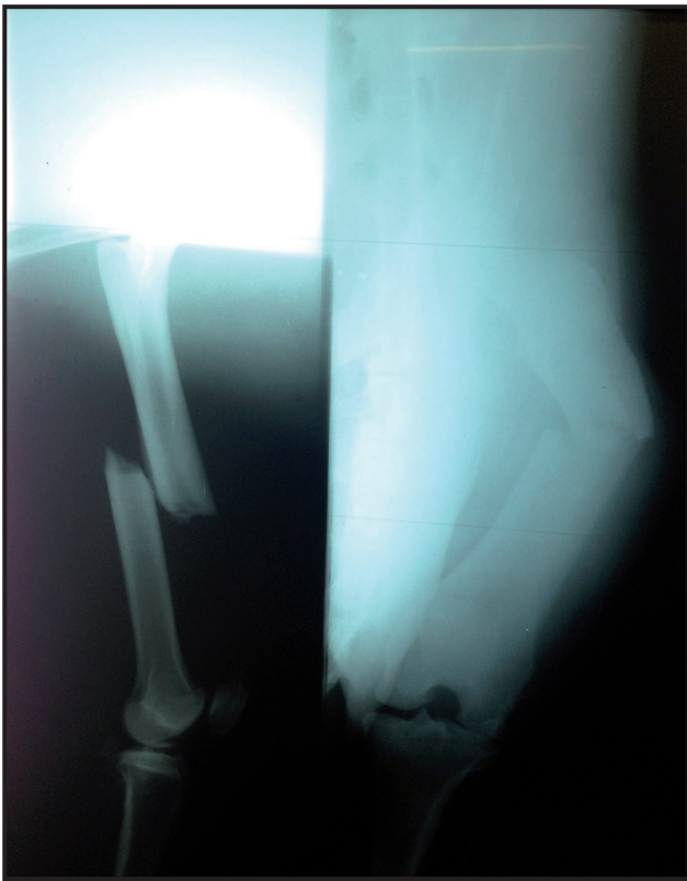
Figure 1. Mediolateral and craniocaudal projections of the right femur show a complete transversal diaphyseal fracture. Giant anteater (Case 1).