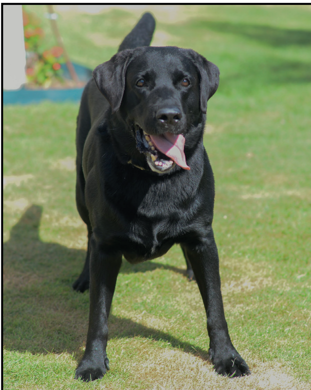
Figure 2. Picture of the dog in December 2017 showing wellness.

Our report shows the successful management of one dog with CanL, CE and HE comorbidity. This success was possible due to early detection and good therapeutic choice. The authors also reinforce the importance of performing differential diagnosis for CVBD in endemic areas, regardless of one infection detected, other pathogens may infect the same animal, and treatment success will depend on commitment of veterinary practitioner to find these pathogens. Additionally, prevent vectors on an infected/suspected animal is ethically fundamental to avoid zoonotic transmission.