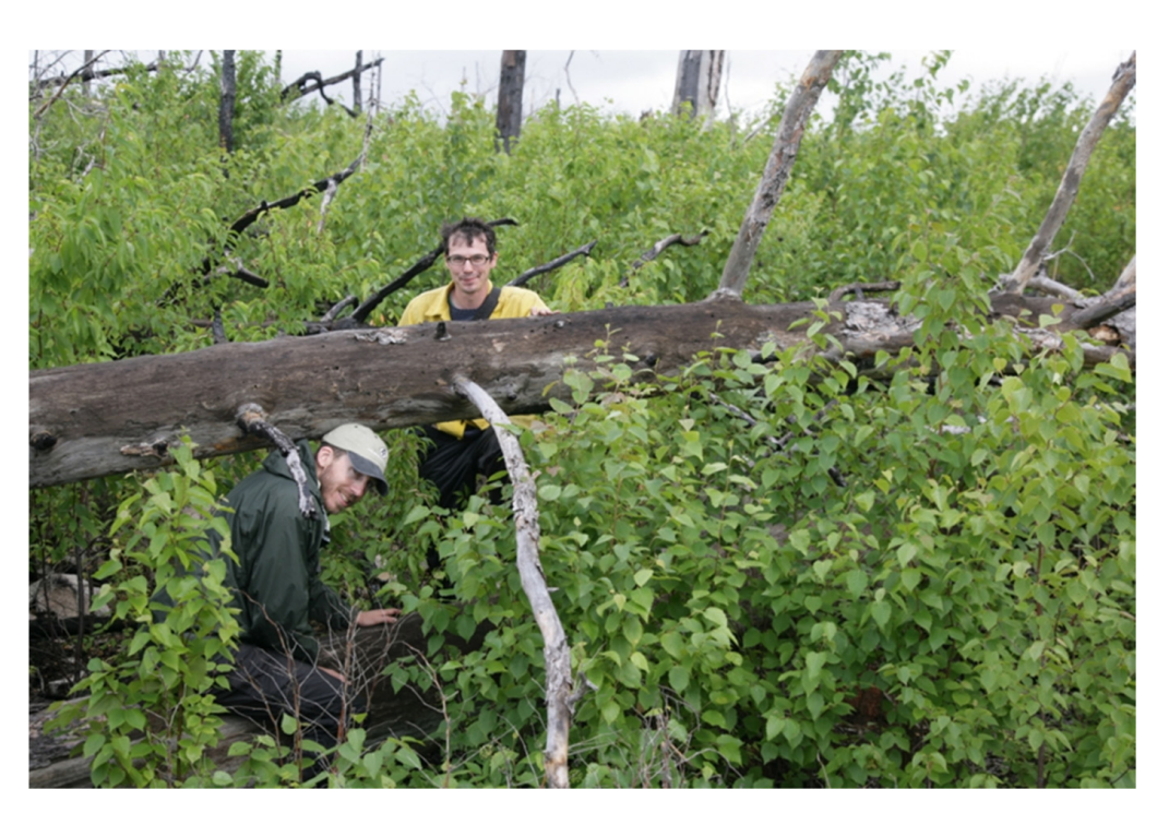
Figure 5. Conifer forest converted to paper birch after a wind and fire combination of disturbances in Minnesota USA. Windstorm was in 1999, the fire in 2002, and photo in 2007.