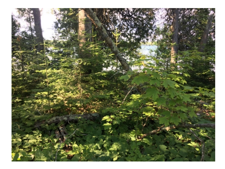
Figure 1. Sugar maple saplings (right) within a boreal balsam fir forest in northern Wisconsin USA. Balsam fir saplings on left.

atures, which were historically lethal to temperate tree species, are rare in the region (<-42 to -44 °C, [25]). 'Summer boreal' and 'winter boreal' forests (where temperate tree species were previously kept out by cool summers or winter minimum temperature, respectively) would thus be affected by different aspects of the changing temperature regime. We note that many temperate tree species have historically been present in the region, but at low numbers and frequencies (e.g., red maple, bur oak, northern red oak, yellow birch), while the northern range limits of many other temperate species lie to the south and would need to migrate into the region from elsewhere.