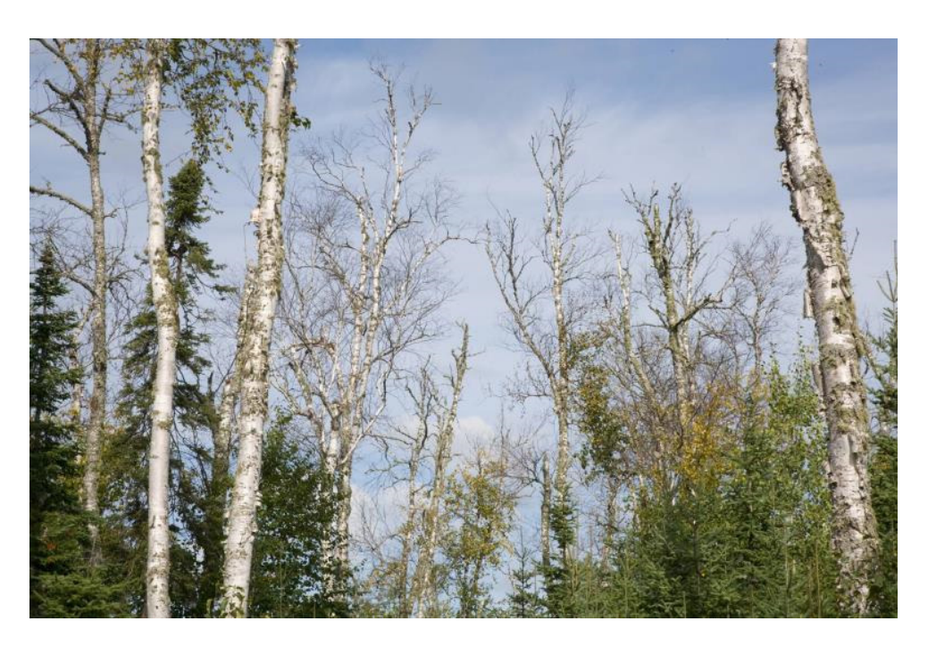
Figure 6. Dying boreal paper birch forest after severe drought in 8 of the 10 most recent summers, North Shore Lake Superior, Minnesota, USA. Photo by David Hansen, September 2008.