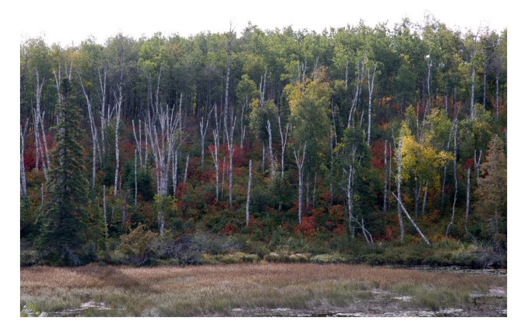
Figure 3. A boreal paper birch, aspen, white spruce and balsam fir forest in northern Minnesota with red maple (red foliage in this autumn picture) in the understory.

rather than a gradual transition as in M1. This would occur at medium spatial extents when derechos (straight-line wind events associated with severe thunderstorms) level the canopy over 10 s to 1000 s of km<sup>2</sup>. Such storms are expected to become more common as the climate warms [26]. Windstorms commonly kill large trees, while leaving most saplings alive [27]. This is a well-known mechanism termed disturbance-mediated accelerated succession [28]. Usually this simply accelerates the normal successional process from shade-intolerant mature trees to shade-tolerant understory trees within a single biome (e.g., paper birch to spruce and fir in the boreal forest, or to hemlock and sugar maple in the temperate forest). However, in the context of a warming climate along the southern boundary of the boreal forest, combined with the observed increased abundance of temperate saplings in the understory [22], the mechanism could cause biome conversion.