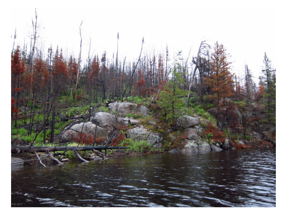
Figure 7. Phenological disturbance—needle reddening of boreal jack pine forest in Minnesota, USA after the anomalously warm March of 2012.

recover after these types of events, following several winters with normal late-winter temperatures [55]. However, occurrences of extremely warm late-winter weather 2–3 years in a row could kill boreal conifers, which have needle life spans of 4–7 years, and do not have the same ability to recover from defoliation as deciduous tree species. Although we do not have observations of more than single years of defoliation due to late-winter warm spells, we do know from other studies of defoliation, that the greater the percent of foliage lost, and the greater the number of consecutive years of defoliation occurs, the greater the mortality rates for boreal conifers [56,57]. The extreme weather of March 2012 is close to an average March projected by some of the GCMs for a business as usual (RPC 8.5) climate for 2070 [17]; thus, sometime between now and then, it is very likely that a run of several consecutive very warm springs will occur. Very large areas could be affected by phenological disturbance, since persistent mid-latitude ridges in the jet stream that lead to long periods of anomalously warm weather, are becoming more common as the arctic warms, and can occur at subcontinental spatial extents [58].