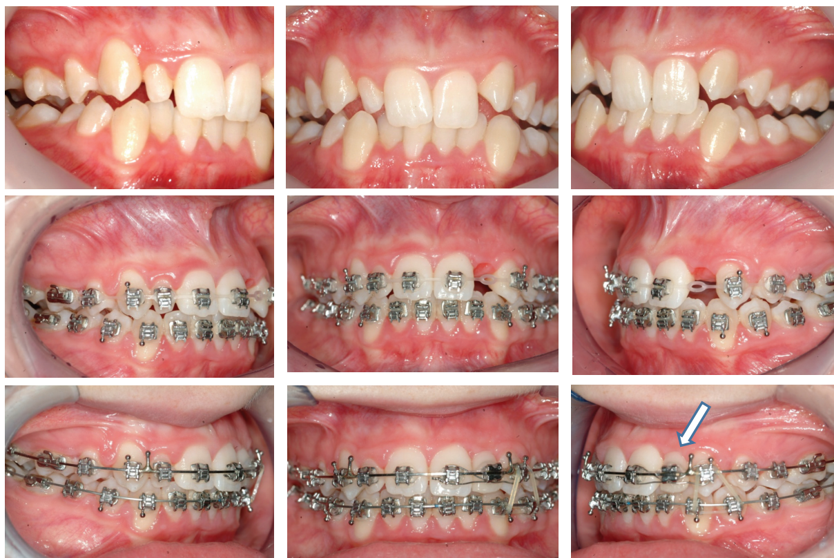
Figure 3. Clinical application of wet denture tooth technique to restore space from missing upper left lateral incisor (arrow).

congenitally missing upper left lateral incisor and a peg-shaped right lateral incisor. Treatment was provided to regain the upper left lateral incisor space by distalisation of the upper left quadrant. Following successful distalisation, the edentulous space was temporarily restored using a denture tooth (Figure 3). After treatment, the regained maxillary left lateral space was restored with a resin bonded bridge.