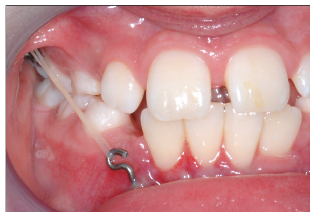
Figure 2. Class III intra-oral elastic forces as applied between the Hybrid Hyrax and Mentoplate arms bilaterally.

It may be hypothesised that the use of a HH in the upper arch and a Mentoplate in the lower arch transfers an orthopaedic force primarily to the skeletal struc-