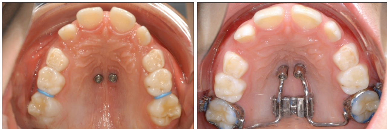
Figure 1. The Hybrid Hyrax (HH) anchored to two mini-implants in the anterior palate and upper molars (Source: University of Düsseldorf, Germany).

skeletal maxillary advancement and to avoid the possible dental side-effect of mesial movement of the dentition resulting in dental crowding, 5 protraction therapy in growing children using skeletal anchorage has recently been advocated. 7-11 However, most studies have employed at least two or more surgical mini-plates or osseointegrated implants, which involve invasive placement and removal procedures.