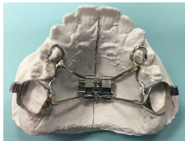
Figure 1. Standardized Ni-Ti MLSAE appliance design including mesial extension arms

Upon delivery, all appliances were evaluated to ensure proper design and pre-activation by one author (KM). Once cemented, the ligatures holding the compressed Ni-Ti leafs were cut. Each patient was seen approximately one week after insertion to ensure that there were no issues with the appliance. Each patient was then seen one month post-delivery and then at monthly intervals when the treating doctor