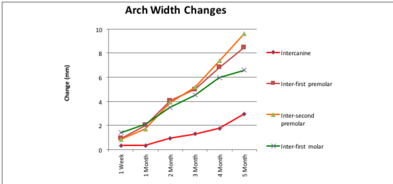
Figure 2. Arch width changes.