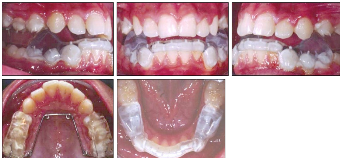
Figure 1. SBTB clinical photographs.

length, an increase in length of the facial axis, an increase in facial height and a reduction in facial convexity. 6 As functional appliance therapy promotes anterior mandibular repositioning during adolescent growth, it appears reasonable to suggest that there may be an associated increase in the size of the PAS as a result.