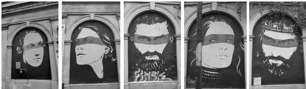
Fig.1. Janowczyk Piotr. Historical mural of Kazimierz. Józefa Street, 17. Kraków, 2015.

So, in the murals of Kraków and Łódź, we can observe an appeal to the theme of the life of the Jewish population in Polish lands. We also note the fact that writers who work in Kraków and Łódź use similar artistic and technical techniques when covering issues. They primarily paint using stencil spray art and choose monochrome colours for murals. At the same time, the artists imitate archival photographs with a hint of the relevant cross-cultural significance of the subjects depicted, their "documentary" and historical truthfulness.