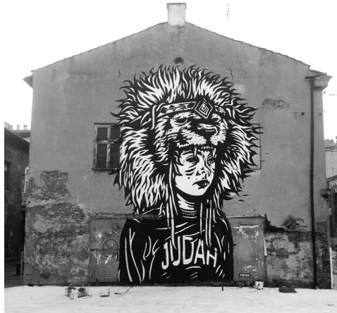
Fig. 2 Peled Pil. Judah. Saint Wawrzyńca Street, 16. Kraków, 2013.