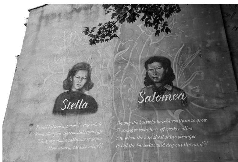
Fig. 6. Marek Edelman Dialogue Centre. Stella & Salomea Mural. Franciszkańska Street, 26. Łódź, 2017.