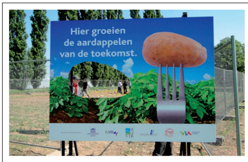
Figure 1. Billboard “Here Grow the Potatoes of the Future”.

The creativity, extent, and manner in which people took part, and especially transformed, the conversation must have exceeded the science communicators’ imagination. Even before the field trials’ materialization, farmers wrote a bold and self-aware open letter entitled “farmers do not want GMOs”, and a collective referred to as the Field Liberation Movement invited people to gather for a field liberation, more specifically a Big Potato Swap, symbolically replacing GMO potatoes by organic ones. Both the grassroots collective of farmers and activists raised deep questions over who gets to say what, in what contexts and with what effects. The collective questioned how science communicators, speaking from