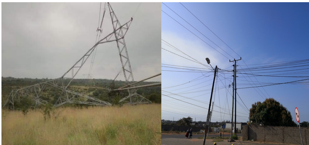
Figure 3: Vandalised power tower (top) and grid network lacking maintenance (bottom)

On the energy supply-side, capacity deficiencies have exacerbated customer affordability problems. EDM now purchases up to 88% of its total electricity needs from outside sources. Some 36% (2,491MW) of this electricity comes from independent power producers (IPPs) at prices that are three to four times higher than those charged by the state-owned company Cahora Bassa Hydroelectric (US$ 0.036/kWh), which manages the country's largest hydroelectric dam, a key source of generation and export (Sebitosi and de Graça, 2009). EDM spends millions of dollars annually buying electricity from the IPPs (Nhamire et al. , 2019) for US$ 0.09–0.10 per kWh, which it then sells at loss for an average of US$