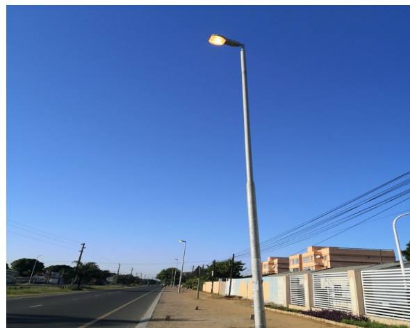
Figure 2: Street lighting switched on in the morning at the National Road 4 (N4)

In key urban and peri-urban areas, residents may engage in electricity theft by bypassing meters or patching into illegal connections (Baptista, 2015). This informal electricity market activity is in part a response to problems of energy affordability for domestic consumers. However, this creates a self-perpetuating cycle of low investment and poor-quality service access. Electricity theft further destabilises electricity connections and reduces EDM's profit, further hindering its capability to maintain a low price-point for consumers. Ordinary urban residents may also build structures such as residential extensions and commercial buildings that require larger power transformers without previously consulting EDM: this threatens to overload transmission and distribution assets, potentially endangering public safety and damaging property. Grid instability is further exacerbated by vandalism and theft of equipment and infrastructure (e.g. theft of electrical cables for producing cooking pans) (